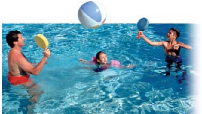
Family time warms up with a solar heated pool!

A VORTEX Solar system requires little to no maintenance and typically lasts 15-20 years.