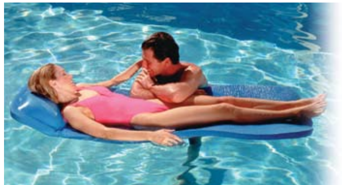
More time for enjoying those quiet moments alone...

The size of the system determines its ability to maintain the pools temperature at a desired level, and the length of your swimming season. 5